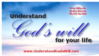
Front side of card