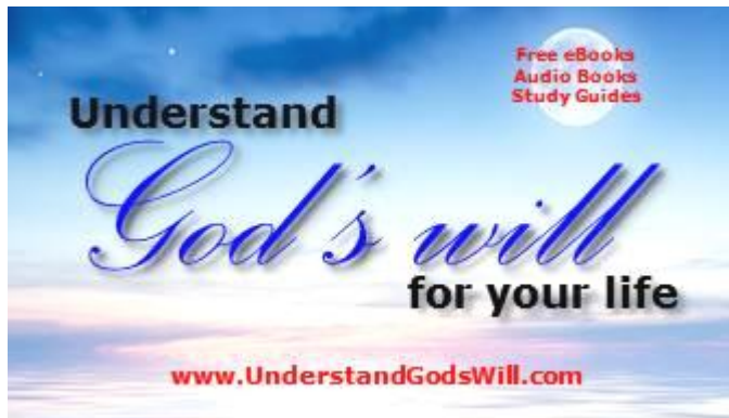
Front side of card